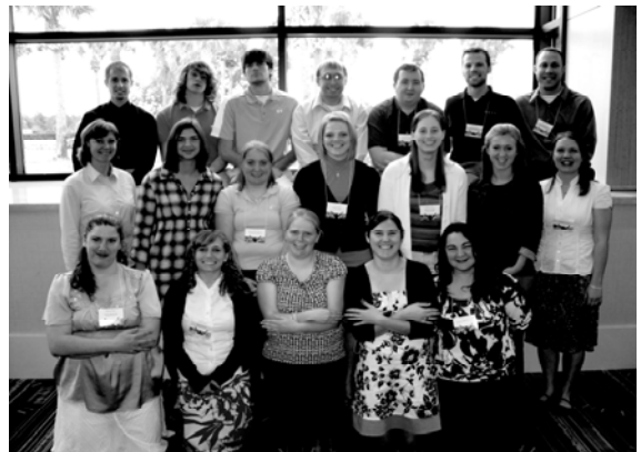
Made For More Conference Students and young adults from EIU

Thank you Sacred Heart parish for your generous support of my mission with FOCUS (The Fellowship of Catholic University Students) at Eastern Illinois University. Recently, I was blessed to attend the FOCUS National Made for More Conference in Orlando, Florida with nearly 4,000 college students from throughout the nation. Our FOCUS team here at EIU took 16 college students and young adults on the 20 hour bus trip down to Orlando. The conference was a huge success, as our students now have a renewed zeal and knowledge of the Catholic faith. During the conference, we had two students go to confession for the first time in over ten years, one student attend their first adoration, and two students who are now discerning the priesthood and religious life! God's graces were definitely flowing through those in attendance of this year's FOCUS National Conference. Please keep the students at EIU in your prayers as they stand as a witness to the Catholic faith on the college campus. Thank you again for all your support and prayers! God Bless!