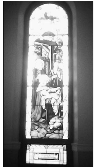
Sacred Heart's Nativity Window

However, there are some details present in this depiction which sometimes escape our first glance, which take deeper reflection to grasp their full meaning. The lamb at the foot of the manger reminds us that Christ is the Lamb of God. The manger in art has often been represented as the first altar of the Lord. The lamb links together the birth of Christ and the manger with the Passion of the Christ and the sacrifice of the Mass on the altar. St. Joseph, on the far left, is dressed in a purple robe, reminding us of the royal line of David reaching back into the Old Testament. ☎