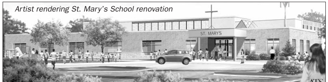
Artist rendering St. Mary's School renovation

also create modern, flexible learning spaces for the two programs that serve as key entry points to the school for families. Finally, the parking lot will be reconfigured to provide a safe, traffic-free play area for our students.