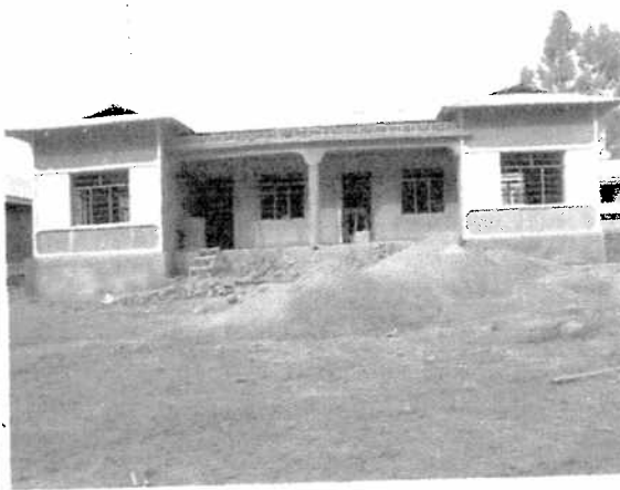
Here is the new administration office building. These offices will house these officers of the school: Director, Principal, Secretary, Treasurer, 2 nd Principal and Academic Master.