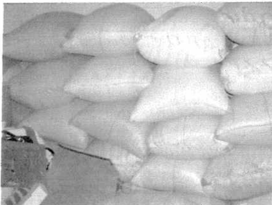
Corn storage at St. Monica's

This firewood will be used for fuel to cook food at the school. This amount of fuel cost approximately $100 and will last about two months.