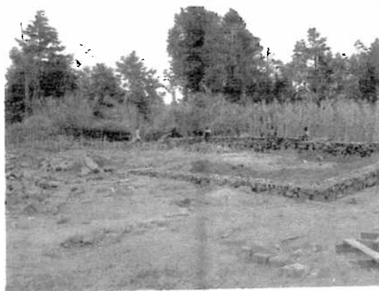
The foundation has now been set for the social hall. Most of the time this hall will be used as the dining hall for the students of St. Monica's. This hall will also be an income generator for the Matamba Parish. It is hoped that villagers will rent this hall for weddings, meetings, etc.