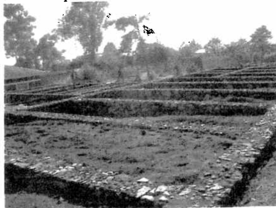
The foundation has been set for the girls' dormitory.