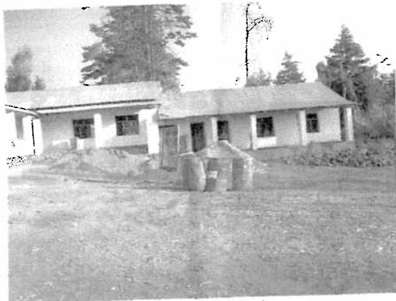
Progress continues on the 3 classrooms.